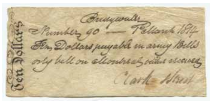
924 Clark & Street , Bridgewater, U.C., Ten Dollars payable in Army Bills, 1814, No.90, ON 40-10-04. Fine+, some foxing. Rare. $1000