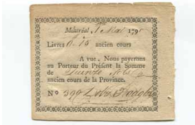
923 Dobie & Badgley , Montreal, Fifteen Sols, 1790, No. 390, QC130-10-02. VF, edge nicks and tears. $180