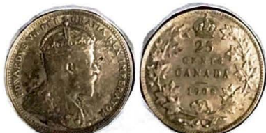
1908. 25 Cents.