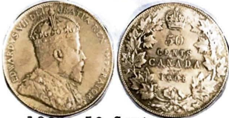
1908. 50 Cents.