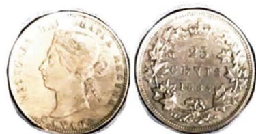
1885. 25 Cents.