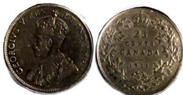
1911. 25 Cents.