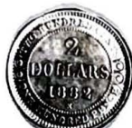
1882. Two Dollars. GOLD.