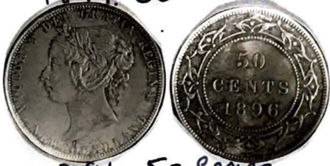
1896. 50 cents.