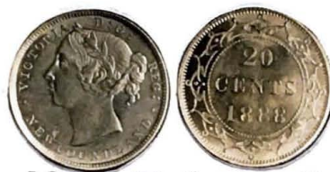
1888. 20 Cents. R. O.