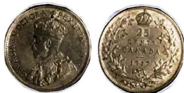
1917. 25 Cents.