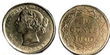
1900. 20 Cents.