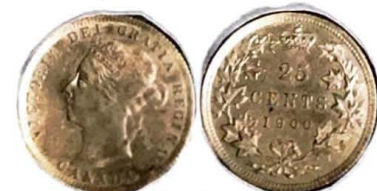
1900. 25 Cents.