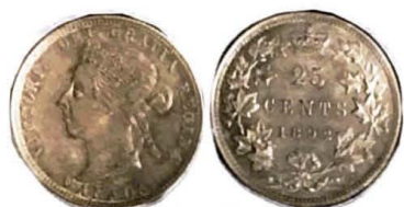
1892. 25 Cents.