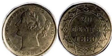
1880. 20 Cents. R. O.