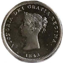
1843. Halfpenny Token. Breton 910. R. 1.