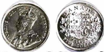
1912. Five Dollars. GOLD.