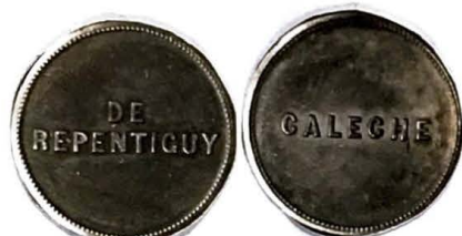
De Repentiguy. CALECHE. Breton 554.