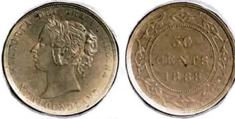
1888. 50 Cents. R. O.