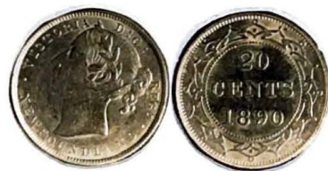
1890. 20 Cents.