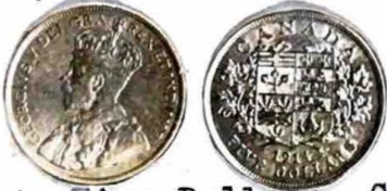
1914. Five Dollars. GOLD.