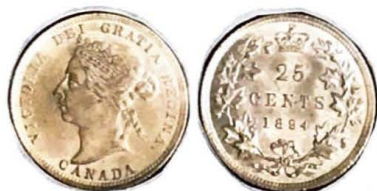
1894. 25 Cents.