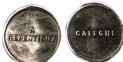
A Repentiguy. CALECHE. Breton 550.