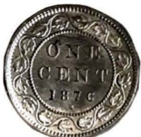
1876. Cent. "H."