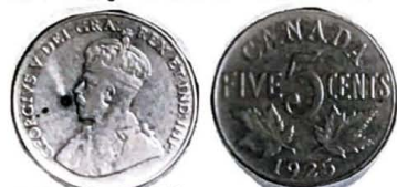
1925. Five Cents.