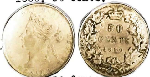
1890. 50 Cents.