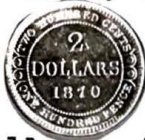
1870. Two Dollars. GOLD.