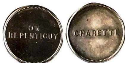
On Repentiguy. CHARENTE. Breton 547.