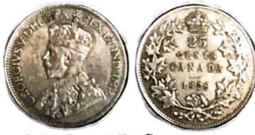
1928. 25 Cents.