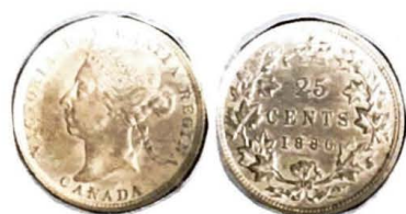
1886. 25 Cents.