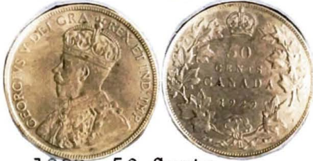
1929. 50 Cents.