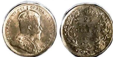
1906. 25 Cents.