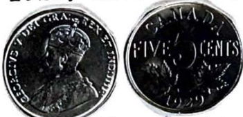
1929. Five Cents.