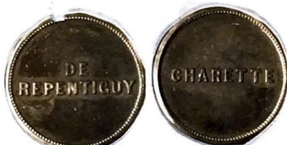
De Repentiguy. CHARENTE. Breton 555.