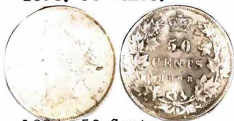
1898. 50 Cents.