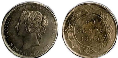
1880. 50 Cents. R. O.