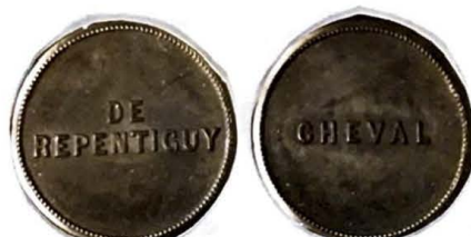
De Repentiguy. CHEVAL. Breton 556.