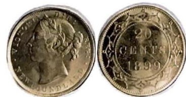
1899. 20 Cents.