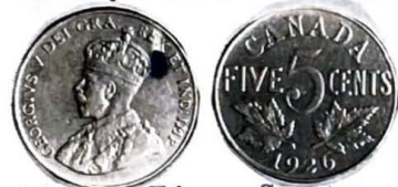
1926. Five Cents.