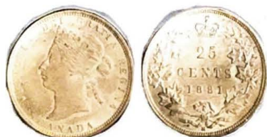
1881. 25 Cents.