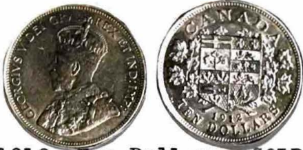
1912. Ten Dollars. GOLD.