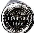
1888. Two Dollars. GOLD.