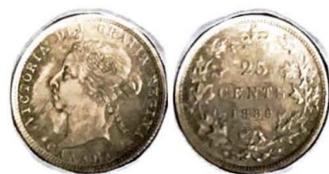
1888. 25 Cents.