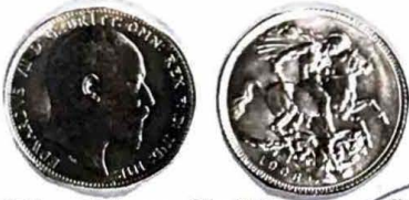
1908. Five Dollars. GOLD. Sovereign.