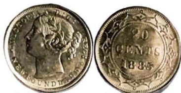
1885. 20 Cents. R. O.