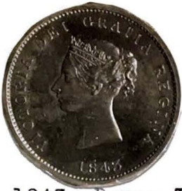
1843. Penny Token. Breton 909. R. 1.