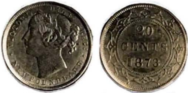
1873. 20 Cents. R. O.