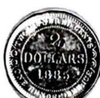
1885. Two Dollars. GOLD.