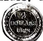
1872. Two Dollars. GOLD.