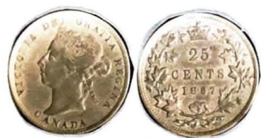
1887. 25 Cents.