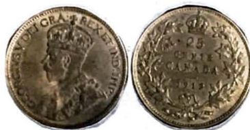
1912. 25 Cents.