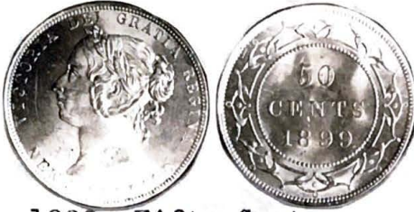
1899. Fifty Cents.