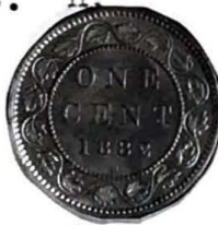
1882. Cent. "H."