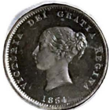
1854. Halfpenny Currency. Breton 912. R. 1.