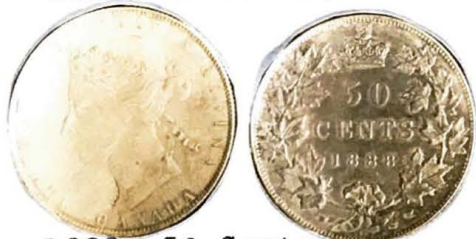
1888. 50 Cents.