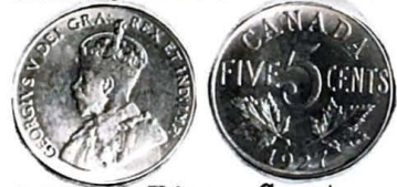
1927. Five Cents.