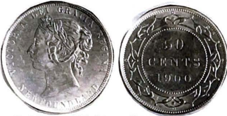
1900. Fifty Cents.