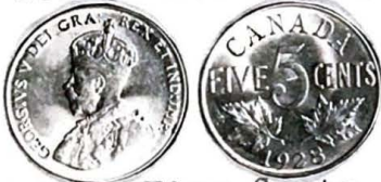
1928. Five Cents.