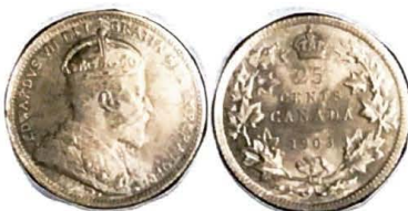
1903. 25 Cents.