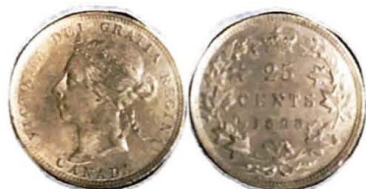
1893. 25 Cents.