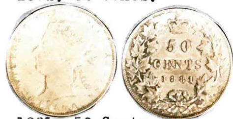
1881. 50 Cents.