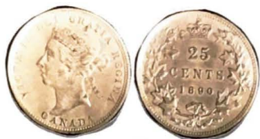
1890. 25 Cents.