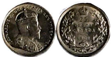
1902. 25 Cents.