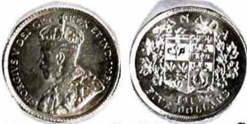
1913. Five Dollars. Gold.