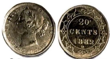
1882. 20 Cents. R. O.