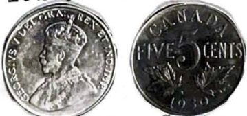
1930. Five Cents.