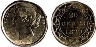
1870. 20 Cents. R. O.