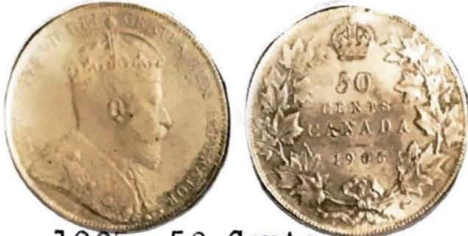
1905. 50 Cents.