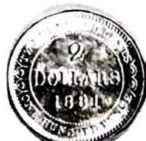
1881. Two Dollars. GOLD.