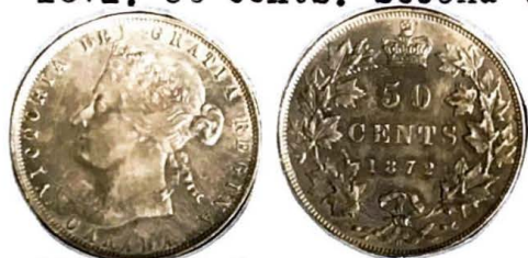
1872. 50 Cents.