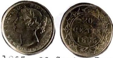
1865. 20 Cents. Breton 947. R. O.