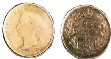
1882. 25 Cents.