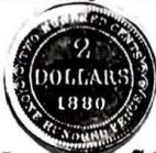
1880. Two Dollars. GOLD.