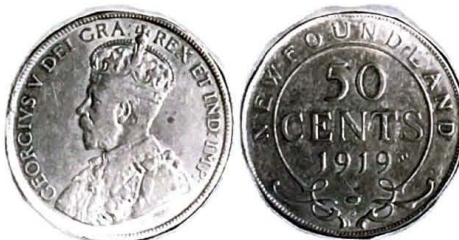
1919. Fifty Cents.