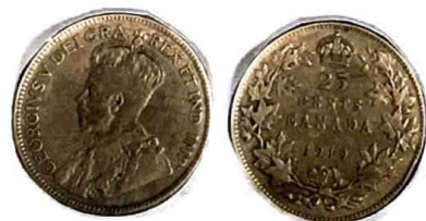
1919. 25 Cents.