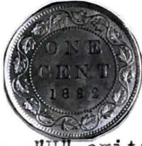
1882. Cent. "H" omitted,