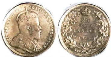
1904. 25 Cents.