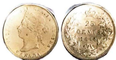
1880. 25 Cents.