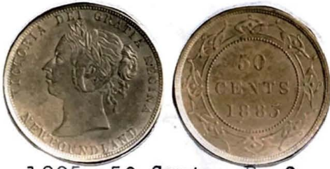
1885. 50 Cents. R. O.