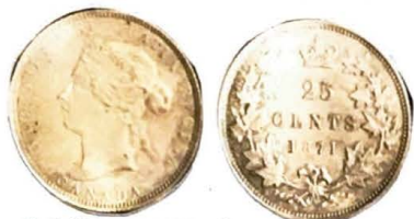
1871. 25 Cents.