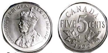
1922. Five Cents.