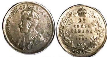
1927. 25 Cents.