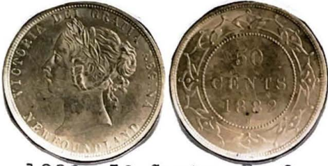
1882. 50 Cents. R. O.