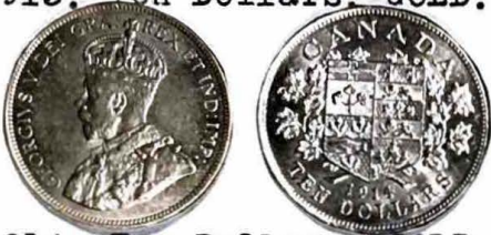
1914. Ten Dollars. GOLD.