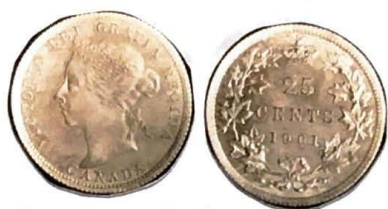
1901. 25 Cents.