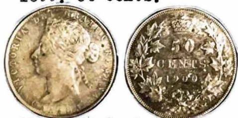
1900. 50 Cents.