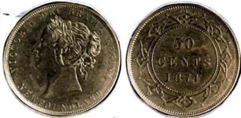
1874. 50 Cents. R. O.