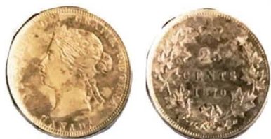
1870. 25 Cents. Breton 941. R. O.