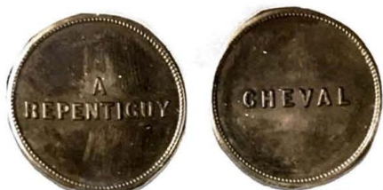
A Repentiguy. CHEVAL. Breton 552.