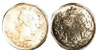
1874. 25 Cents.