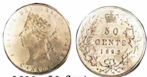
1892. 50 Cents.