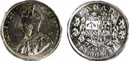
1913. Ten Dollars. GOLD.