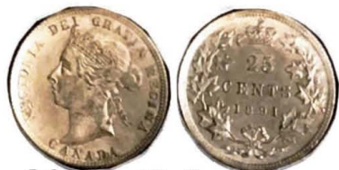
1891. 25 Cents.