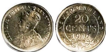
1912. 20 Cents.