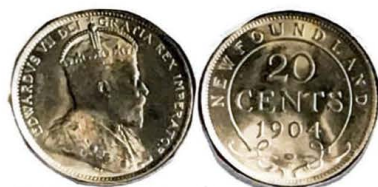
1904. 20 Cents.