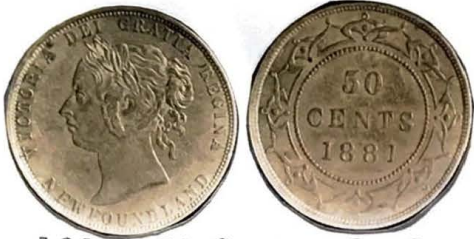
1881. 50 Cents. R. O.