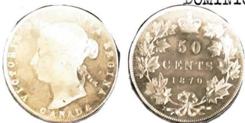
1870. 50 Cents. Breton 940. R. O.