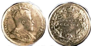
1905. 25 Cents.