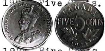
1924. Five Cents.