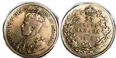
1918. 25 Cents.