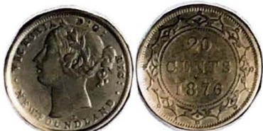
1876. 20 Cents. R. O.