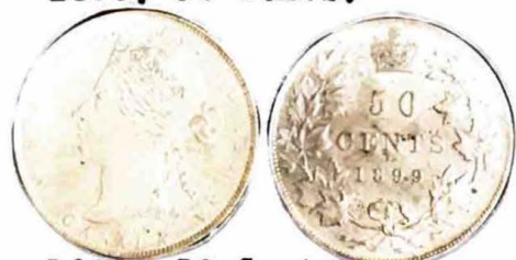
1899. 50 Cents.