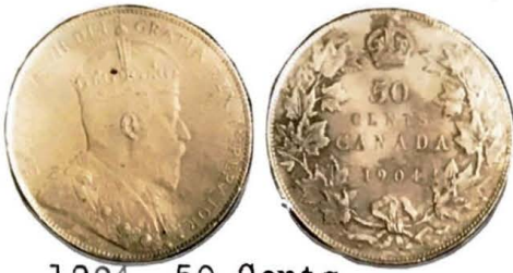
1904. 50 Cents.