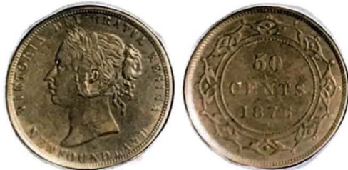
1876. 50 Cents. R. O.