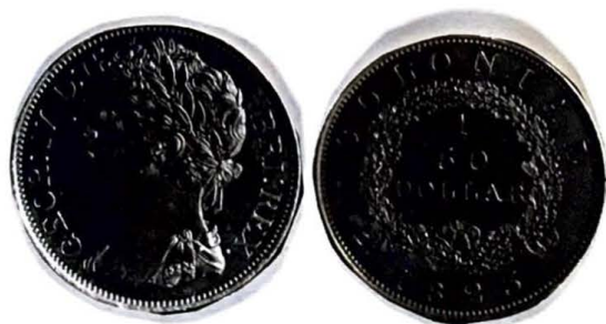
No. 1--Obv. GEOR; IV. D: G: REX, laureated and draped bust of George IV. to the left. Rev. COLONIAL 1823. A wreath of oak leaves enclosing 1-50 DOLLAR. Bronze. Size 34 millimeters.

"As no list of these patterns has ever been prepared, and believing that such a list would be of interest to the many, who have taken up the study of Canadian coins, I propose to publish one here, with such historical notes and comments, as may seem to me to be helpful to students of the series. This seems all the more necessary as those who have prepared works on Canadian coins, have in a great measure, overlooked even the heretofore known varieties.