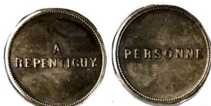
A Repentiguy. PERSONNE. Breton 553.