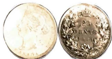
1883. 25 Cents.