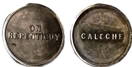
On Repentiguy. CALECHE. Breton 546.