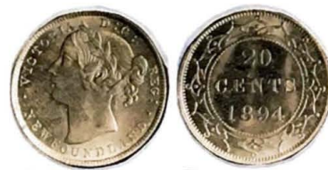
1894. 20 Cents.