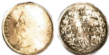
1872. 25 Cents.