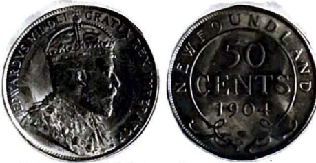
1904. Fifty Cents.