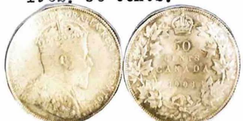
1903. 50 Cents.