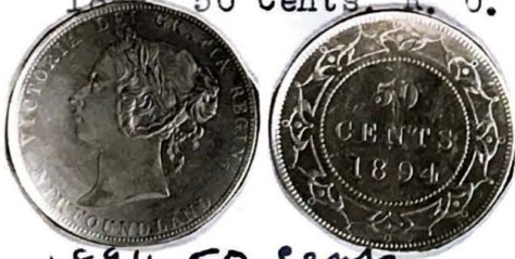
1894. 50 cents.