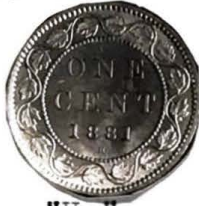
1881. Cent. "H."