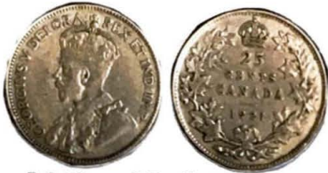
1921. 25 Cents.