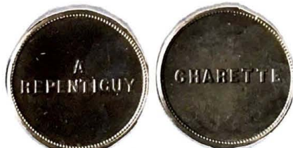
A Repentiguy. CHARENTE. Breton 551.