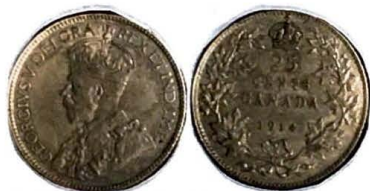
1914. 25 Cents.