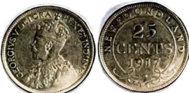
1917. 20 Cents.