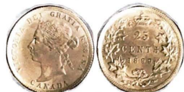
1899. 25 Cents.