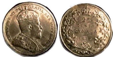
1910. 25 Cents.