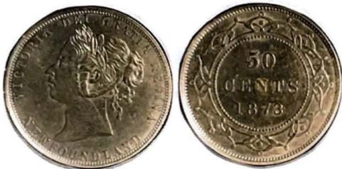
1873. 50 Cents. R. O.