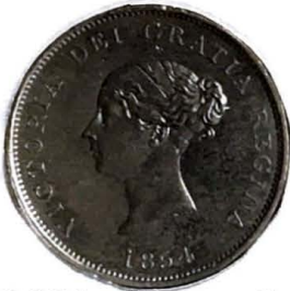
1854. Penny Currency. Breton 911. R. 1.