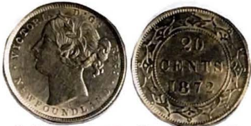
1872. 20 Cents. R. O.