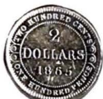
1865. TWO DOLLARS. Gold.