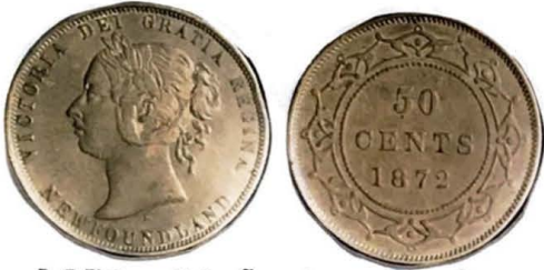
1872. 50 Cents. R. O.