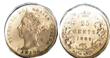
1889. 25 Cents.