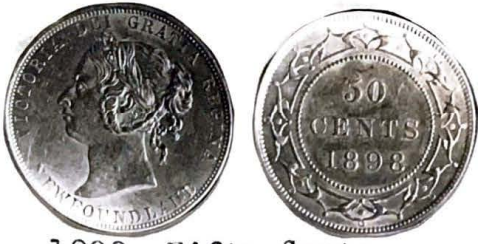
1898. Fifty Cents.