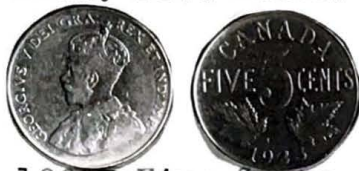
1923. Five Cents.