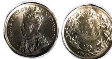
1929. 25 Cents.