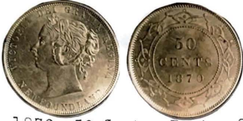
1870. 50 Cents. Breton 946. R. O.