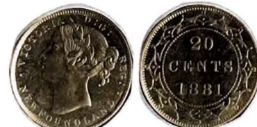
1881. 20 Cents. R. O.