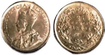
1920. 25 Cents.