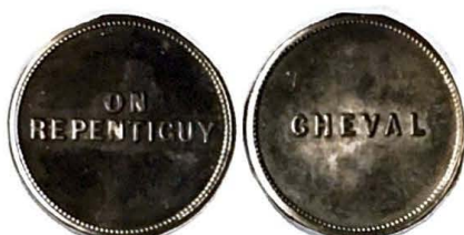
On Repentiguy. CHEVAL. Breton 548,