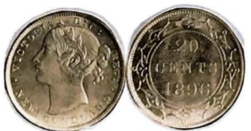
1896. 20 Cents.