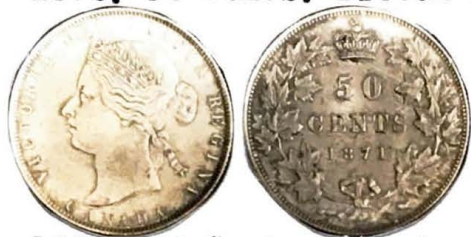
1871. 50 Cents. First variety.