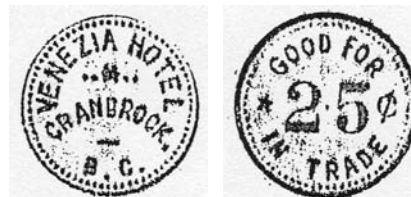
C8360d B:R:24 “In Trade” is 17 mm across