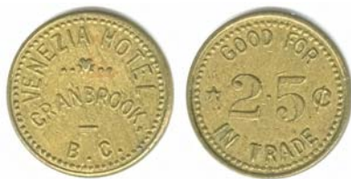
C8360c B:R:24 “In Trade” is 15 mm across