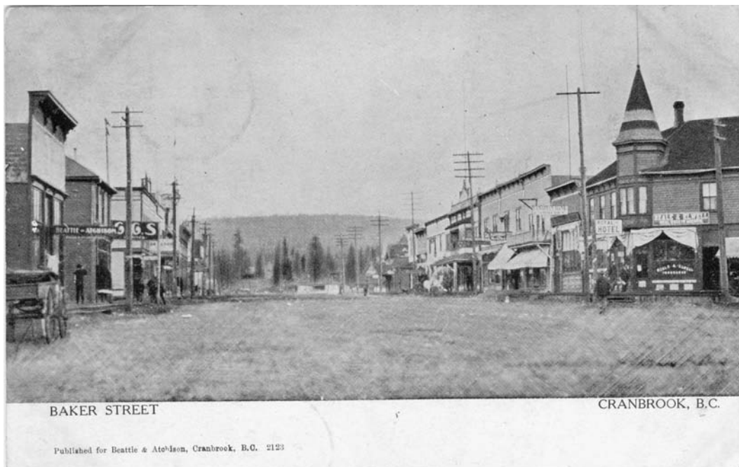
The Royal Hotel is at the right of this view (postally used September 4, 1909).