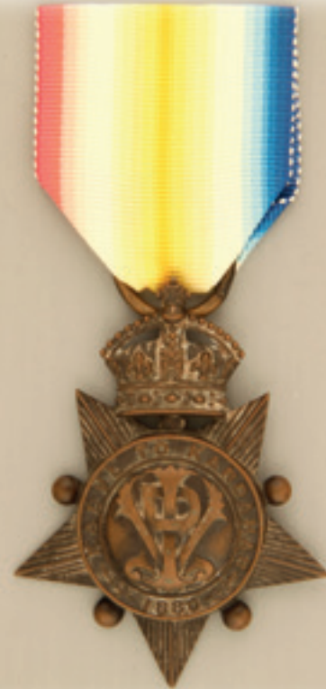
423 Kabul to Kandahar Star 1878-80 , Bronze (reverse impressed: B449 PRIVATE JAS: SHEPHERD 66 TH FOOT), VF. $400