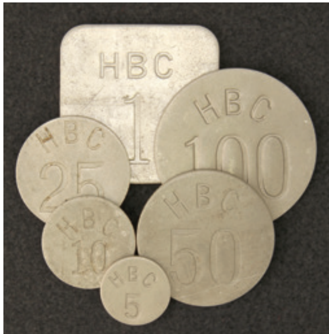
340 Eastern Arctic, HBC 5, 10, 25, 50 and 100, round; HBC 1, square, Gringras 285, a, b, c, d, and e, all are incuse, uniface and made of Aluminium. EF, some light spotting. 6pcs. $400