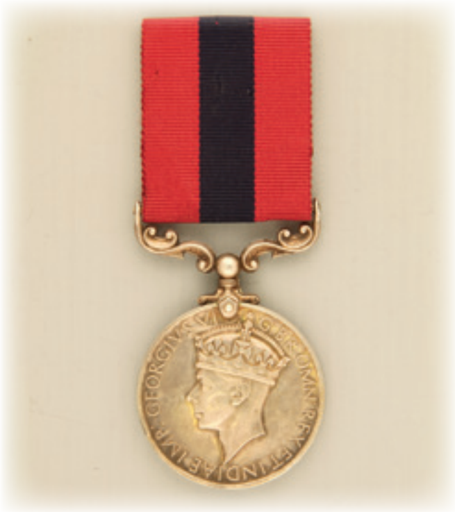
404 Distinguished Conduct Medal , George VI, IND: IMP: type, unnamed as issued to foreign recipients. VF. $650