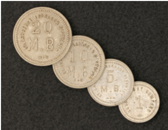
338 St. Lawrence Labrador District, 1MB, 5MB, 10MB and 20MB, Aluminium, Gringras, 260, a, b, and c. VF. 4pcs. $300