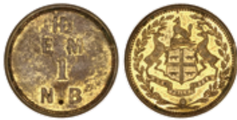
336 East Main District, 1NB, Brass, Br-926, Gringras 220b, punched mark for use at Moose Factory. VF+. $200