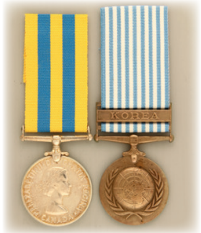
511 Canadian Korea Pair , Korea Medal and United Nations Korea Medal, (engraved: SF-21437 R.F. JACKSON). Fine. 2pcs. $300