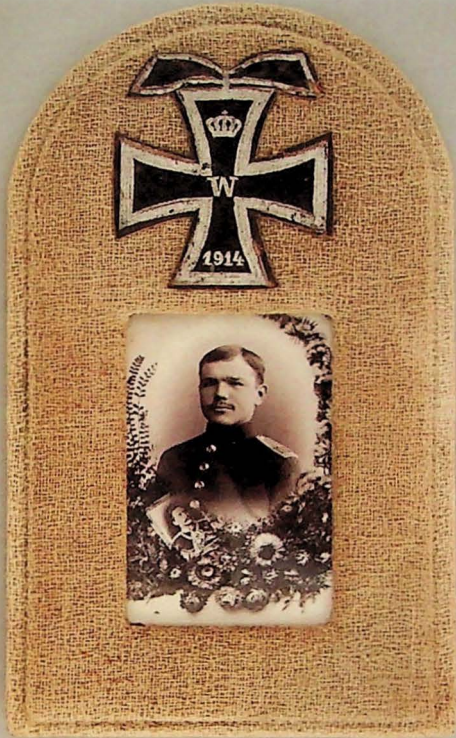
400 Framed Portrait of WWI German Soldier , portrait is mounted in a fabric frame which has an Imperial Iron Cross in cloth mounted above portrait. Very attractive and unusual item. Fine. $100