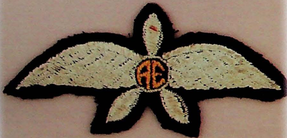
523 Aero Engineer Wings, pale blue wings, pale blue propeller, in the centre in yellow, "AE", all on black wool backing. EF. Scarce. $130