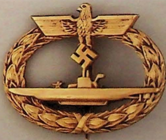
401 Third Reich, Gilt U-Boat War Badge , wide pin fastener with well made heavy hinge, manufacturer's mark "Schwerin Berlin 68". Very nice quality. EF. $230