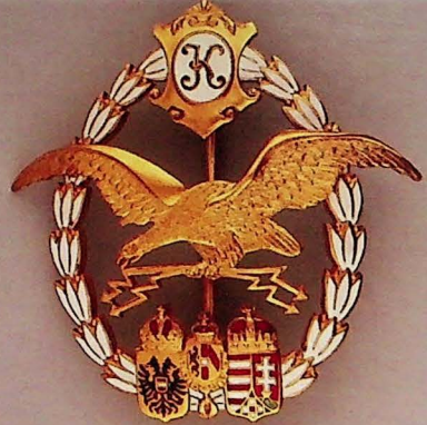
525 Austrian, 1917-18 Flyer Badge, in gilt and enamel, with two small rivets on reverse, brooch pin fastener. EF $300