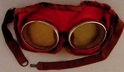
521 RFC, Triplex Flying Goggles, yellow lenses, leather fur lined, with strap. VF. Scarce. $200