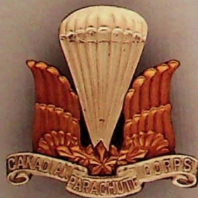
148 The Canadian Parachute Corps, officer's bi-metal cap badge, similar to Maz. S-24A, white metal overlay on the parachute and banner, held by five rivets, manufacturer's mark "W. Scully Montreal", two screw post terminals. EF. $1,100