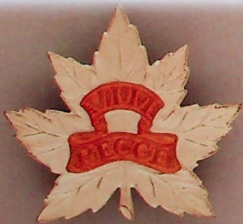
147 8 th Reconnaissance Regiment, bi-metal cap badge, Maz. C-40. EF. $400