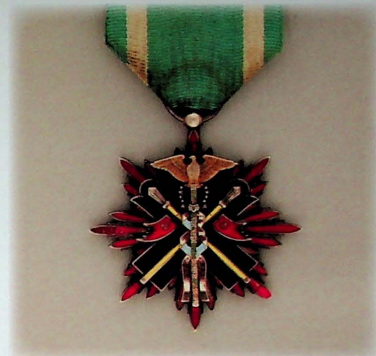
115 Order of The Golden Kite 5 th Class , Silver Gilt, Silver and enamel with original ribbon, 46 x 50 mm, a few small repairs to enamel. VF. $280