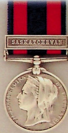
78 North West Canada Medal 1885 , one clasp Saskatchewan, (indented: BUGLER T. CUTHBERT, 10 TH BATT. R.G.), the TH behind the unit number is very worn, two edge knocks on reverse. Plated VG. $700

Charles Faille is shown on the roll for the medal with the 65 th Mt. Royal Rifles.