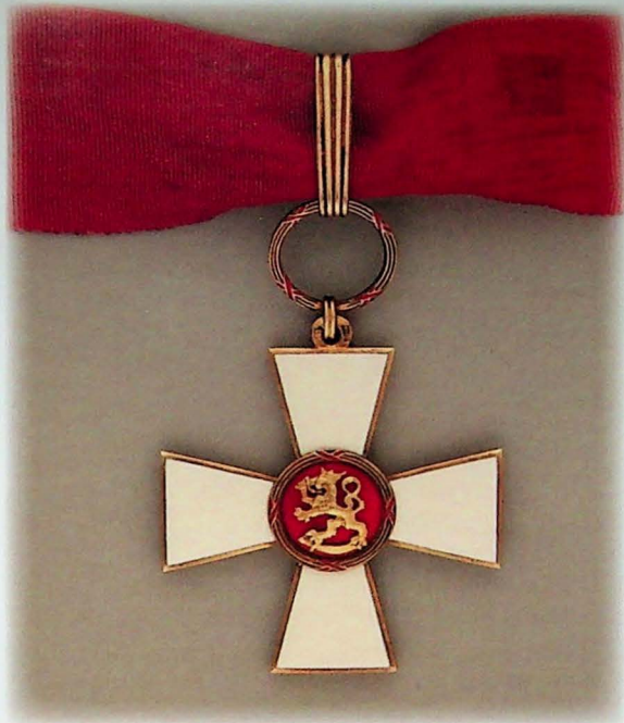
111 Order of The Lion Commander's Neck Badge , Silver Gilt and enamel, 49.2 mm. A. Tillander hallmark on medal loop, (A.T. Crown, 813H), complete ribbon with some stains. EF. $240