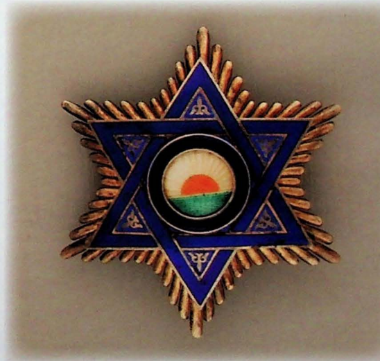
117 Order of Mehdavia Breast Star , Silver and enamel, 75mm, on the front the rising sun design in the centre is loose. Arabic script on the back centre Gilt medallion. Fine. $150