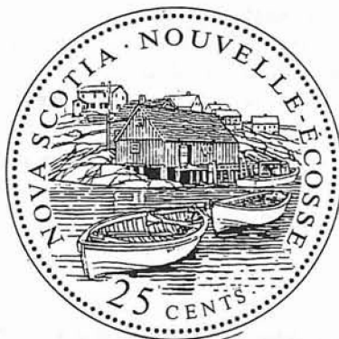
RAYMOND TAYLOR 1992 25 CENT "NOVA SCOTIA"