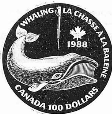
RAYMOND TAYLOR 1988 $100 "WHALING"