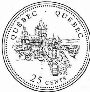
DAVID CRAIG 1992 25 CENT "QUEBEC"