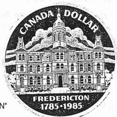
RAYMOND TAYLOR 1985 $1 "FREDERICTON"