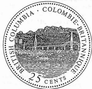
RAYMOND TAYLOR 1992 25 CENT "B.C."