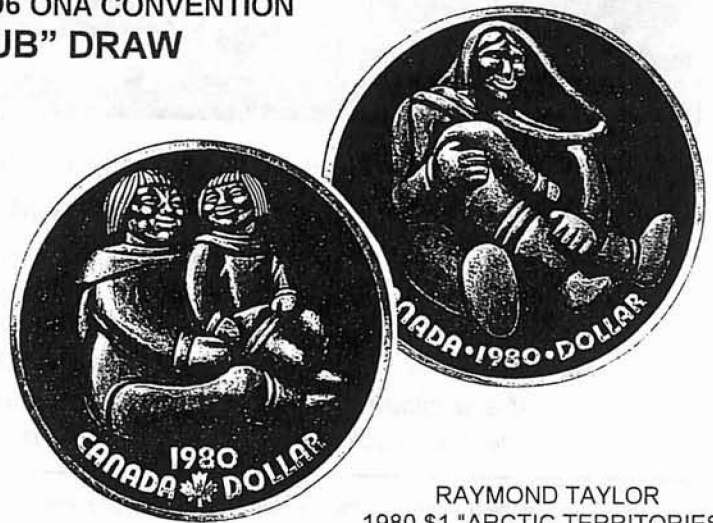
RAYMOND TAYLOR 1980 $1 "ARCTIC TERRITORIES"