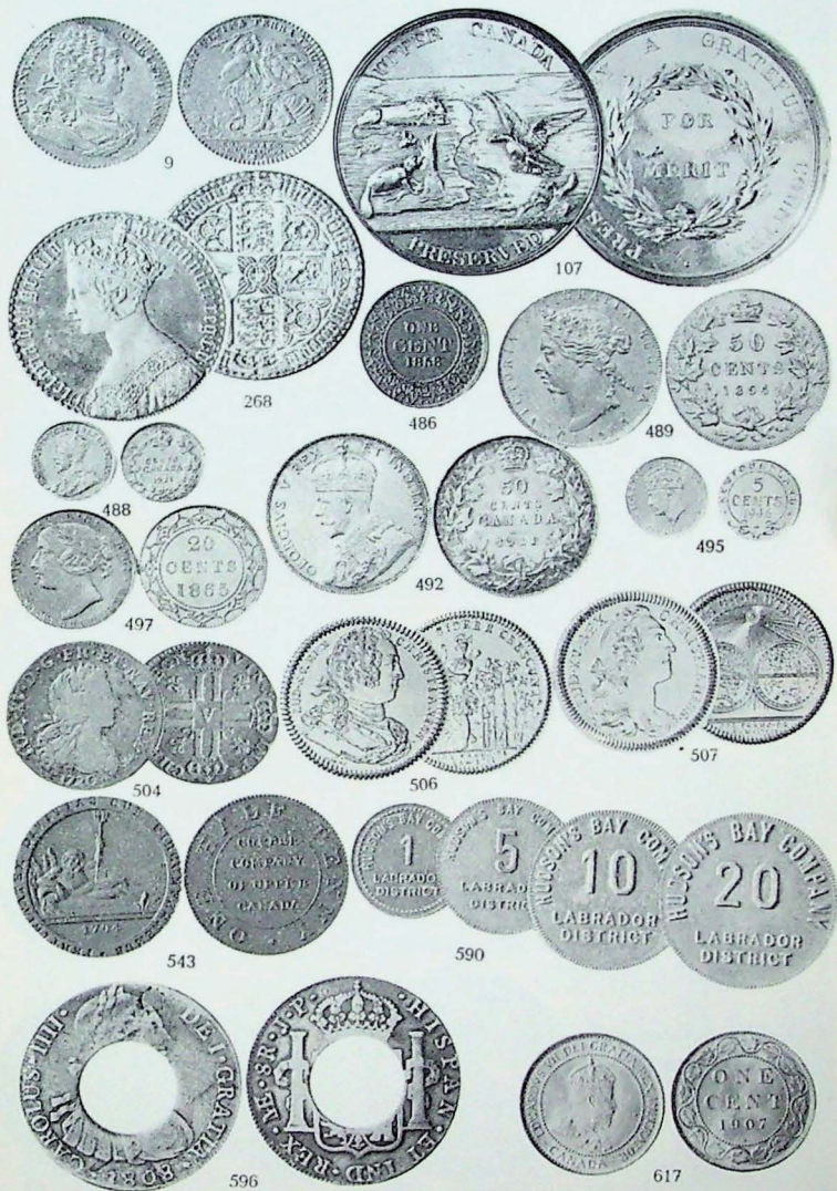
ILLUSTRATIONS SHOWN AT A REDUCED SIZE