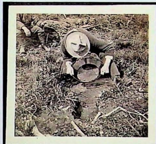
Fanning 49's method

round the Cuff embroidered 1 Row for a General (Lined) 2 " for a Colonel (Lined) 3 " for a Lt Colonel Major 3 " for a Capt. (Lined) 2 " for an Major " — Please turn over [#23]