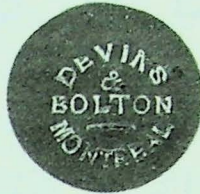
Scarcer countermark type

The firm of Devins & Bolton is probably one of the most well known to collectors of Canadian colonial coins, having been responsible for the famous worm pastille token (Br. 569) and for the issuance of what must undoubtedly be the most extensively countermarked coin in America.