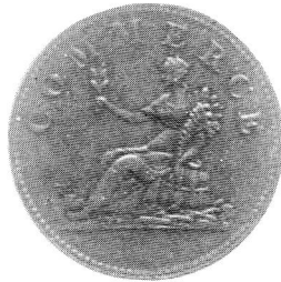
Reverse of No. 41.

41. Obv. Bust laureated with eight leaves, three at top. Without letter H on truncation. The acorn below point of bust emerges from middle leaf. From a perfect die. (Same as No. 29.) Rev. Female facing to left, seated on a bale of goods, laurel sprig in her right hand, a cornucopia in her left. Broken planks on right of ground. COMMERCE. No date. Oblique milling on edge. R. 8. The undated variety.