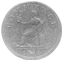
Reverse of No. 30.

29. Obv. Bust laureated with eight leaves, three at top. Without letter H on truncation. The acorn below point of bust emerges from middle leaf. From a rusted die. Rev. Same as No. 28. R. 9. 8 leaves.