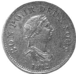
Obverse of No. 36.

34. Obv. Bust within a divided wreath. 1812. Small, oval rosette fastening drapery. Two acorns below truncation. In the date the tops of figures 1 are double cut; the first is below band of drapery. Rev. Similar. Without date. In cornucopia, an apple below three cherries; four leaves in same, the second from bottom is weakly struck, only point shows. Letter H on ground stands upright. R. 2. Small vessel variety.